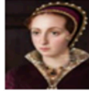
Year 2 Lady Jane Grey