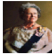
Year 6 The Queen Mother