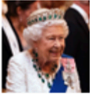
Year 1 Queen Elizabeth II

Every class did their own research on an influential woman ruler. These women also linked to our LOCAL HISTORY ENQUIRES