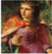
Year 3 Eleanor of Aquitaine