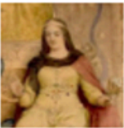
Year 5 Emma of Normandy