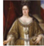
Year 4 Queen Anne