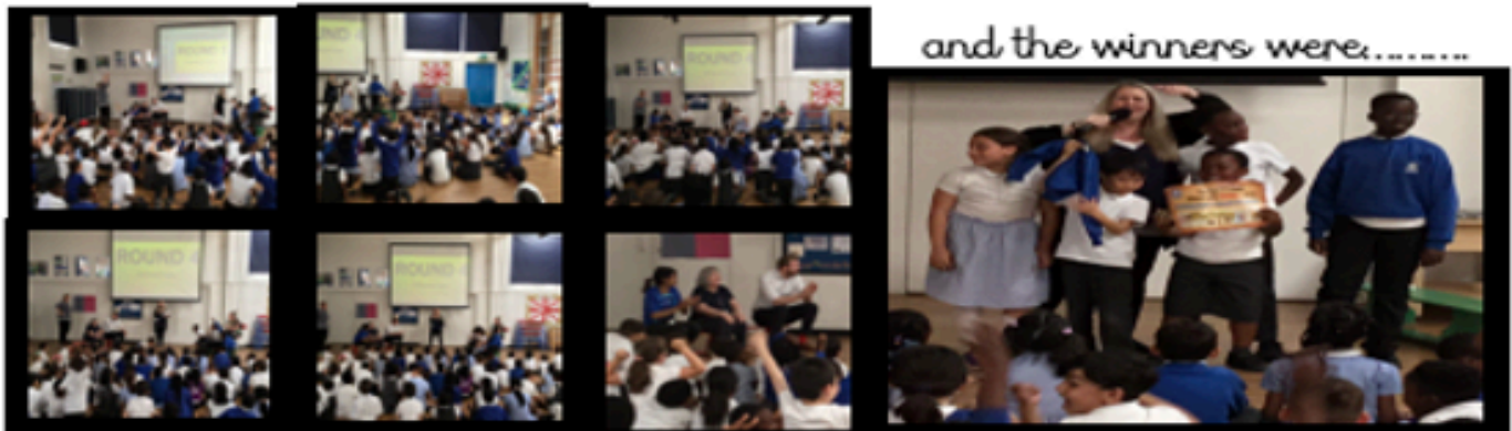
and the winners were.....

Throughout the whole of this year we have been entering a competition to win a place on the panel against the staff. It was a very tense competition!