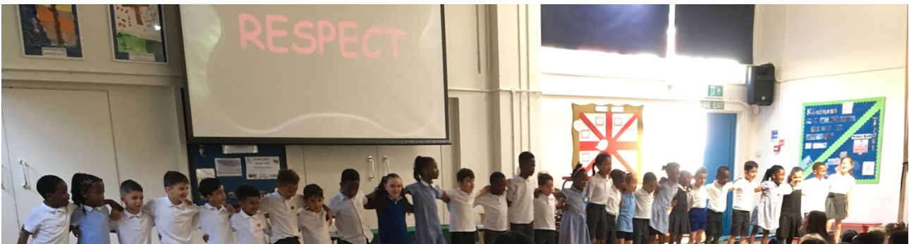
Year 1, our respect ambassadors shared their class assembly with us this week- explaining what respect means and how we show it to others. They sang and shared actions and words that they use with each other. Well done!