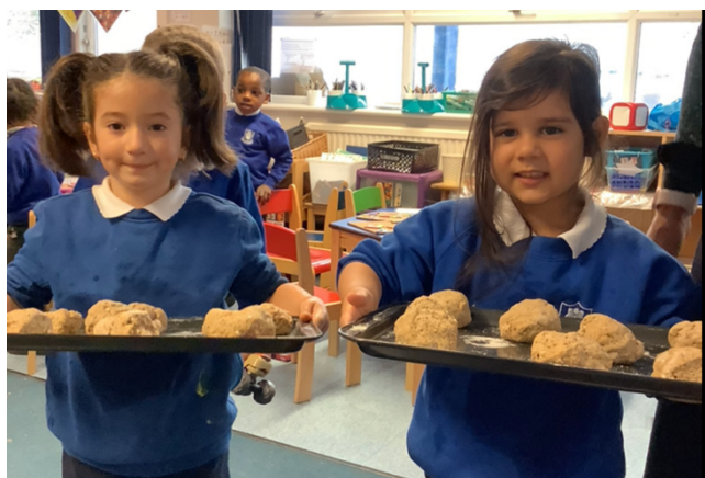
Making bread as part of Harvest

St James' CE Primary School is committed to the safeguarding of our pupils and staff.