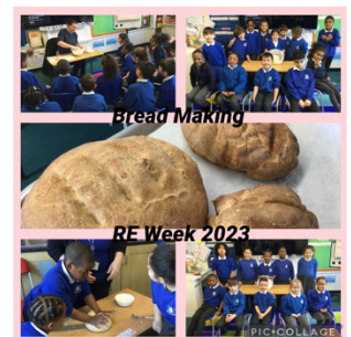
RE week 2023