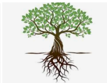
freedom to Flourish

Our vision at St James' CE Primary School, is inspired by Matthew 13 [Parable of the Sower]