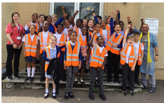
Year 4 visiting the Mandir

Religious Education (RE) in a Church school will enable our children to acquire a rich and deep knowledge and understanding of Christian belief and practice, this will include the ways in which it is unique and diverse. Children at St James' can expect an approach that engages with biblical text and theological ideas.