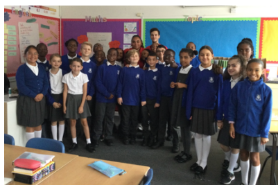
Fire Safety Talk from London Fire Brigade

Our PSHE curriculum is based on the '1 decision' programme. This PSHE teaching aims to give children the knowledge, skills and understanding to lead confident, healthy and independent lives. PSHE underpins life connecting to our School Vision, School Values and the British Values.